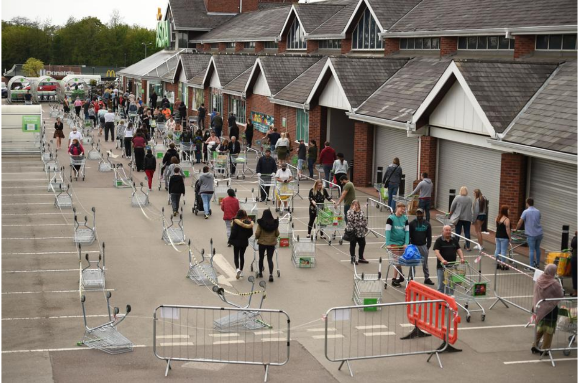
A billionaire's worst nightmare: A vaccination queue in a supermarket car park.

"It's about secrecy and discretion and also the feeling of exclusivity. They don't want to go where everyone else goes. They want to have special treatment because this is their normal standard."