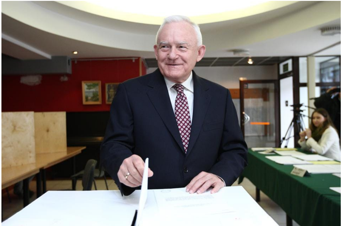
Former Polish prime minister Leszek Miller

A former prime minister of Poland has received a Covid-19 vaccination ahead of healthcare workers just as other rich and powerful individuals attempt to buy their way to the front of the vaccine queue.